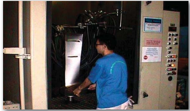
PEENING OF AIRFOIL TO RESTORE FATIGUE STRENGTH OF BLADE

Asian Surface Technologies Pte. Ltd A Joint Venture between PAS Technologies, SIA Engineering Co., and Pratt & Whitney