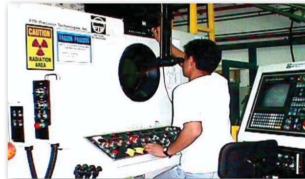
ELECTRON BEAM WELDER