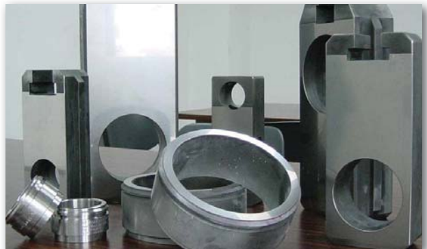
OIL FIELD GATES & SEATS WITH D-GUN™ AND HVOF COATINGS

Contact us for a comprehensive portfolio of capabilities, services, fast turnaround times, consistent and repeatable results.